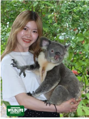
2024 Southern Cross University scholarship recipient

In addition, Saitama Prefecture has exchange programs with Southern Cross University, which has a campus on the Gold Coast in Queensland. The prefecture has been sending one scholarship student to the English school affiliated with the university every year.