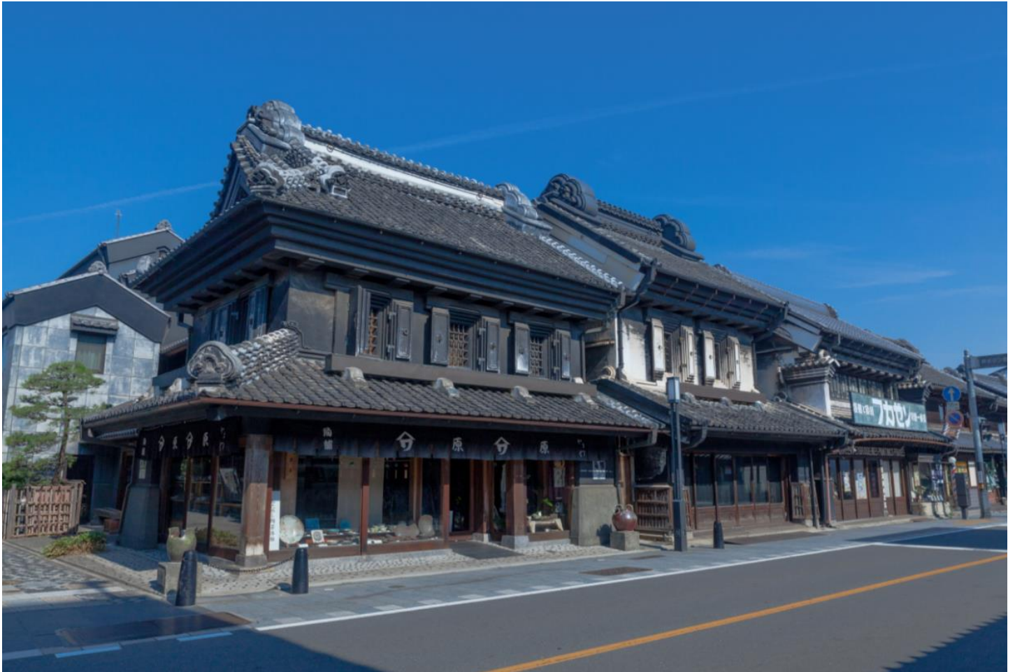
Kawagoe's traditional warehouses ( kurazukuri )