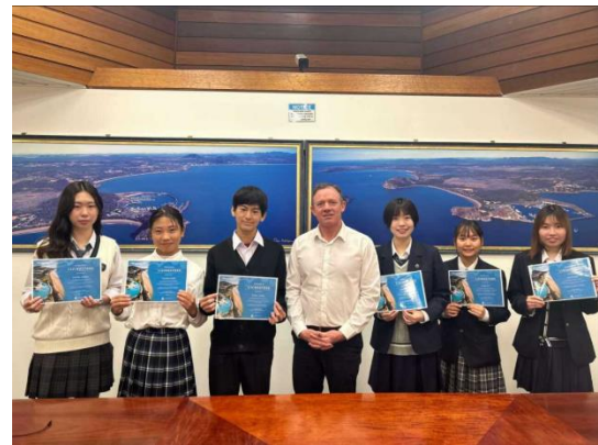
2024 High school student delegation from Saitama

To commemorate the 40th anniversary of the sister state relationship this year, the Consul-General of Japan to Brisbane kindly hosted an event - An Afternoon Tea Celebrating 40 Years of Sister-State Relations between Queensland and Saitama - when six Saitama high school students visited Queensland on the mutual exchange program. Through this event, the invitees, including the six students, Queensland state government staff and members of the Saitama Kenjinkai Queensland, had the opportunity to network and deepen the friendship between Queensland and Saitama.