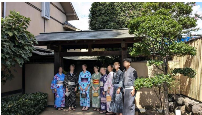
2024 High school student delegation from Queensland

In October 1984, Saitama Prefecture formed a sister state relationship with Queensland in Australia, fostering a strong friendship over many years through exchanges such as regular visits by delegations and mutual exchange programs for high school students and teachers.