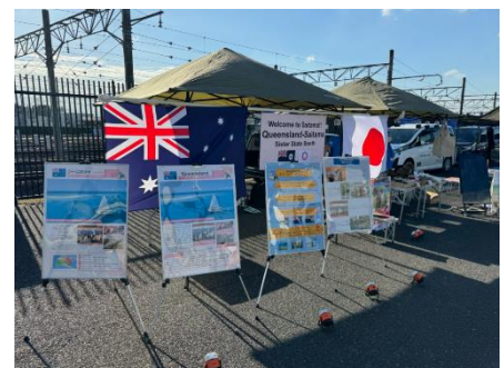
40 th sister state anniversary promotion booth

Saitama Prefecture also promoted the Queensland-Saitama sister state relationship by organising a special booth for the 40th anniversary of the relationship at the soccer match between Japan and Australia for the World Cup qualifying round in Asia held at Saitama Stadium 2002 in October 2024.